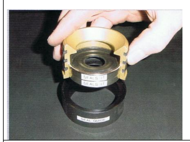
Step 1 – Place axle seal housing into counter bore of seal guide.