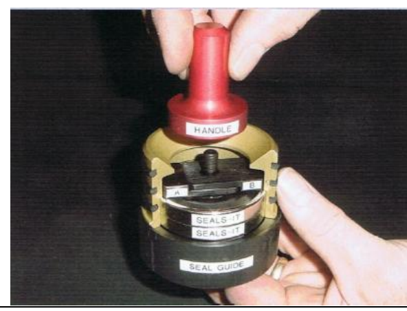
Step 4 – Screw handle onto jaw A stud until tight.