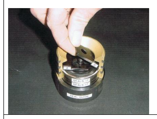
Step 3 – Place jaw B in cavity over screw.