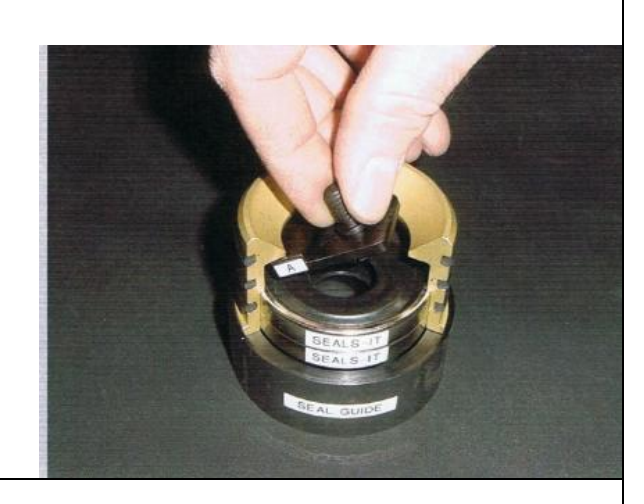
Step 2 – Place jaw A in cavity on top of insert.